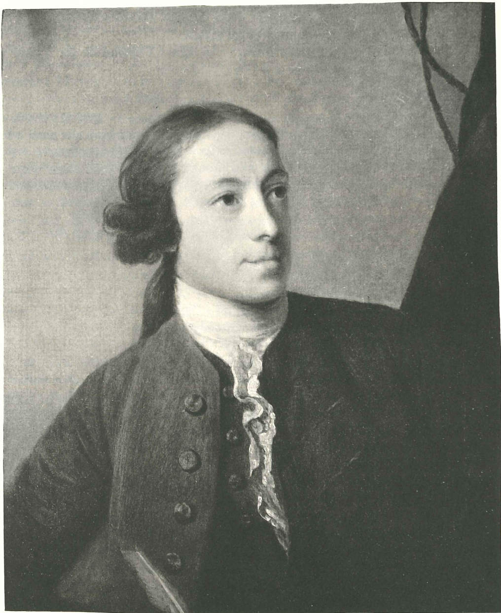
Allan Ramsay's portrait of Horace Walpole.