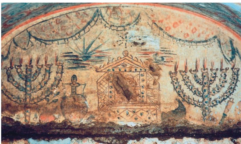
Figure 12. From a wall painting in the Villa Torlonia Catacomb Rome, fourth century.

How are we to explain the striking absence of such images in ancient synagogues? If, as I have argued, the purpose of artistic representations of ritual objects was not to duplicate actual ritual objects that were in plain view of the synagogue audiences, then they would have been unnecessary there, where the actual open doors of the ark and the contained scrolls would have been apparent. Conversely, this would explain their presence mainly in funerary contexts where actual arks and scrolls would not have been present.