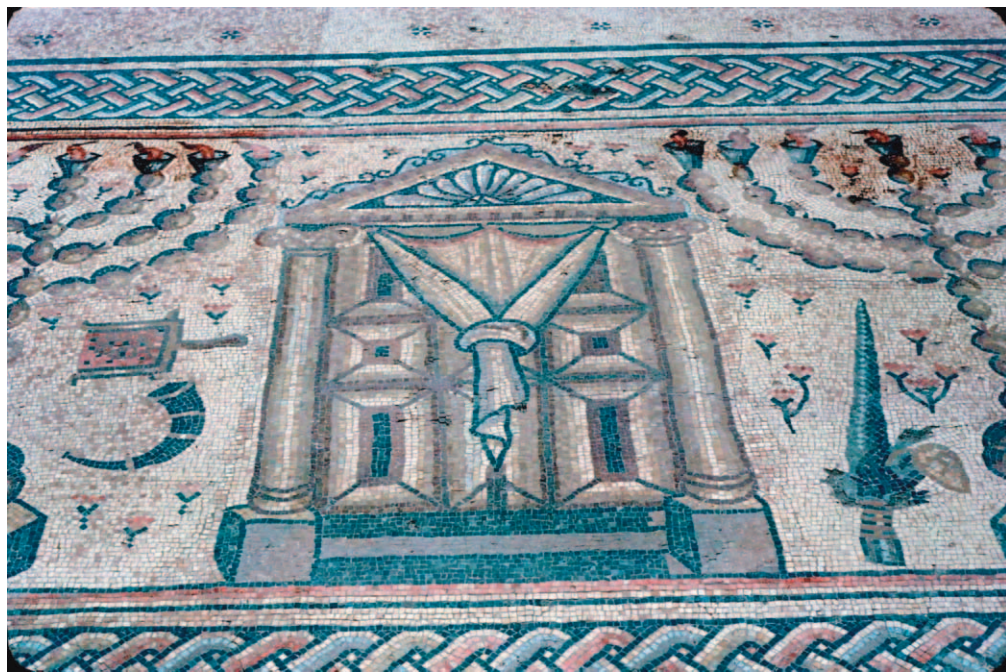
Figure 1. Synagogue floor mosaic at Hammat Tiberias.

What a difference a few centuries can make! Beginning in the third century CE, the number and variety of representations of Torah shrines and arks of the scrolls, whether in mosaics, paintings, etchings, carvings, or inscriptions, both in the land of Israel and in the diaspora, increase dramatically, especially in synagogues and funerary locations. 4 All of these ritual objects (including the shofar , etrog , lulav , and incense shovel) are associated with the now-gone Jerusalem Temple. For the most part, however, these consist of artistic representations, rather than the objects themselves. That is, whether in floor mosaics, wall paintings, funerary plaques, oil lamp decorations, or graffiti, the vast bulk are two-dimensional, rather than three-dimensional (although some are sculpted reliefs), as fragments of actual aediculae (literally mini-shrines, here meaning Torah shrines) are rare (Levine 2005: 354). Likewise,