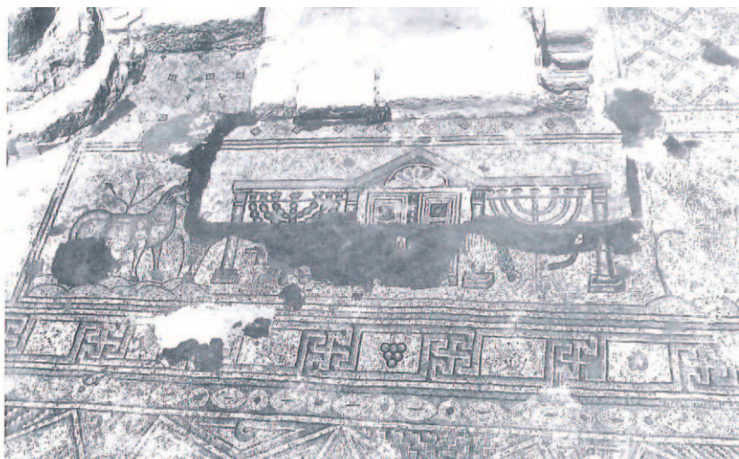
Figure 11. Susiya synagogue mosaic of Torah ark/Temple entrance.