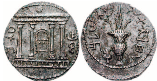
Figure 4. Architectural face on a Bar Kokhba coin.