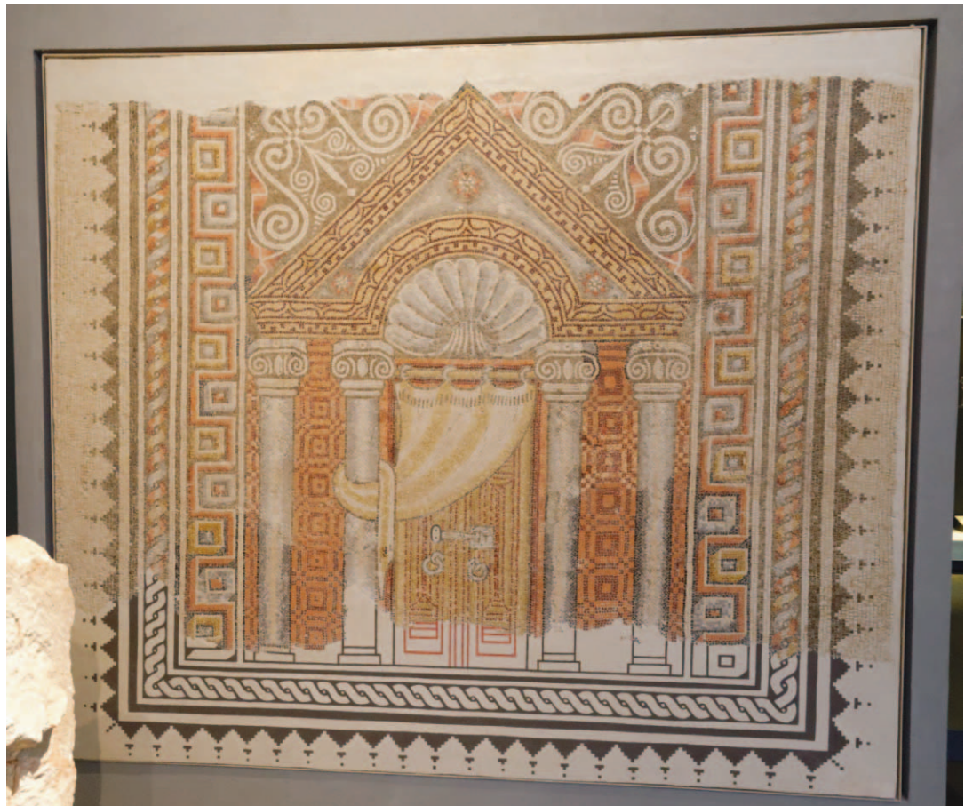
Figure 6. From a Samaritan synagogue in Khirbet Samara.