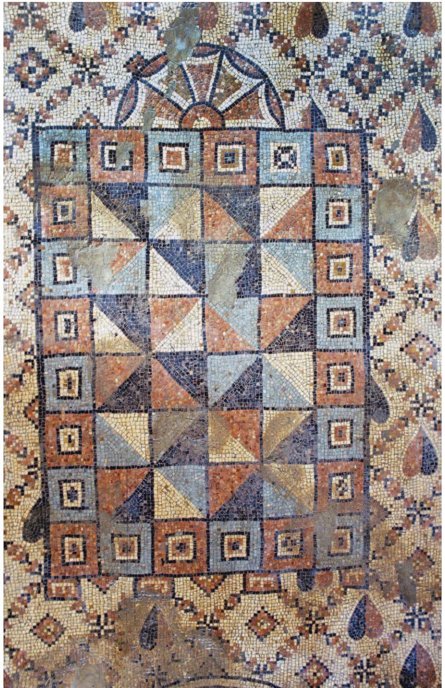
Figure 9. Jericho synagogue mosaic floor.