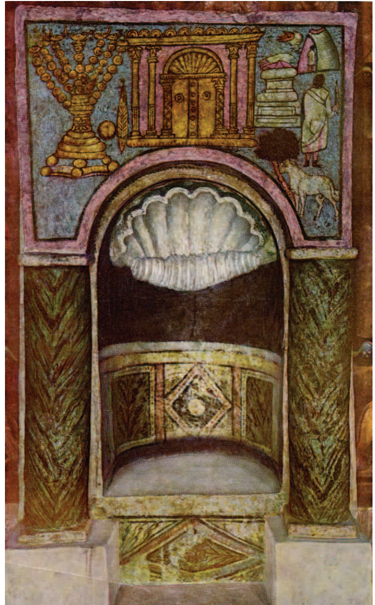
Figure 3. Torah niche on western wall of synagogue at Dura Europos.