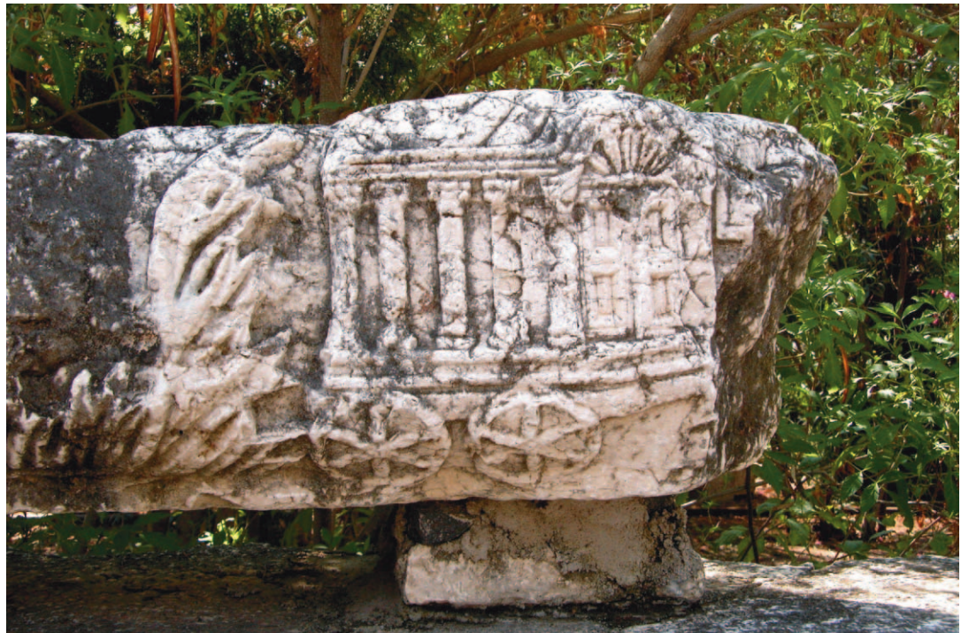
Figure 5. From the synagogue at Capernaum.

Likewise, the Susiya synagogue's (figs. 10 and 11) mosaic images of Torah shrines do not necessarily depict the building's furniture, but are symbolic, much like the depictions of the rams (Werlin 2015: 158): “While we can be reasonably certain that a Torah shrine of some sort did exist in the Susiya synagogue, it would not be wise to seek details in the mosaic depictions.” Artistic representations should be interpreted in their own rights (and contexts), instead of as two-dimensional furniture inventories of proximate three-dimensional objects which have, for the most part, not survived. Otherwise, they would have been redundant to worshipers (see similarly Weiss 2005: 235).