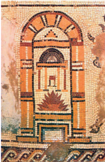
Figure 8. From Theotokos Chapel, Memorial Moses Church at Mt. Nebo, early seventh century. After Saller 1941: frontispiece; by permission of Franciscan Press.