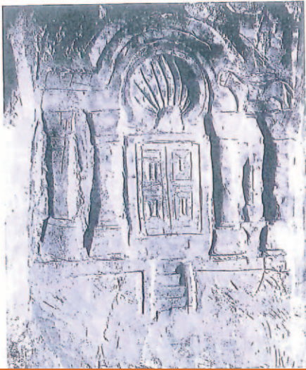
Figure 7. Relief of a Torah shrine from catacomb 4 at Beth She'arim.