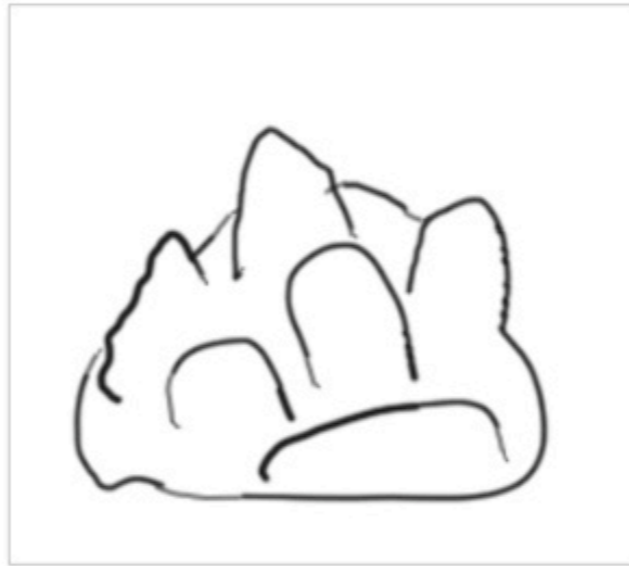
Snowstorm fades to show snow-covered mounds. "But we're okay because the Robo Snow Removal Service will go to work." 3 sec.