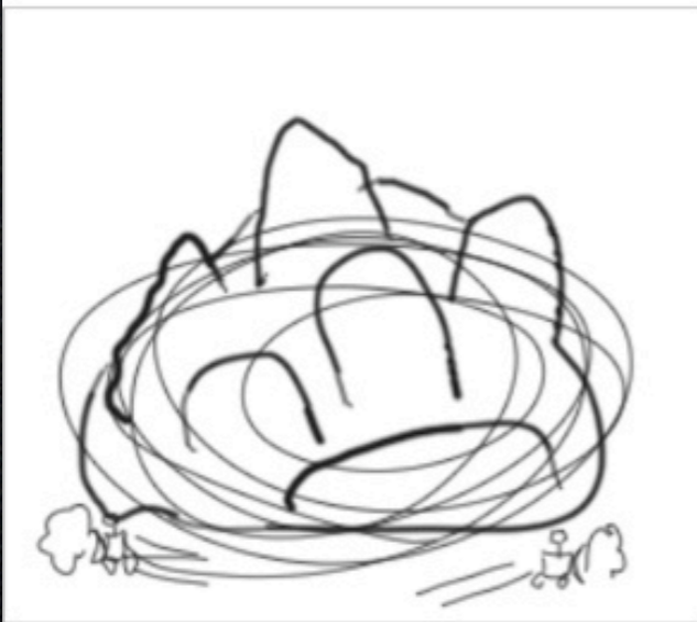
Shifts to snow covered city scene where robots whirl around city, removing snow. Snow "melts away", revealing city buildings. 7 sec.