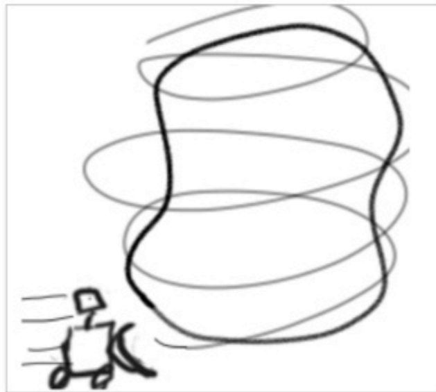
Scene shifts to one large mound which a robot spots and abruptly stops in front of. Then quickly, the robot whirls around the mound, melting and removing the snow. 4 sec.