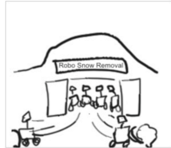
Closeup of one of the mounds. Doors spring open to reveal the garage of the Robo Snow Removal Service, out of which robots come streaming out, pushing snow away. 3 sec.