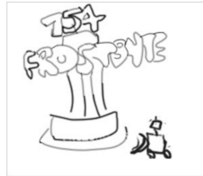
That last mound turns out to be a large statue of "Team 754 - Frostbyte". The statue animates as the robot watches. 4 sec.